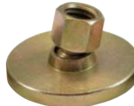
Nut Height: "G" = 1/2", 5/8", 11/16", 3/4" for Threads: M12, M16, M20, M24