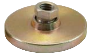
Nut Height: "G" = 3/16" for Threads: M6, M8, M10