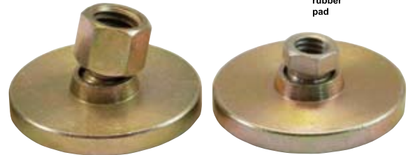
Nut Height: "G" = 1/2", 5/8", 11/16", 3/4" for Threads: 1/2-13, 5/8-11, 3/4-10, 1-8