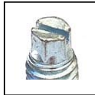
Top Hex (-HX) and Slot (-SL)