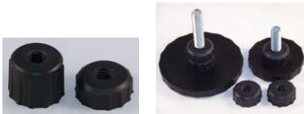
* Patent Pending

These glass-filled black nylon threaded knob hubs can be used for many applications; as an adjustable height shoulder on a knob or leveler or stacked to create a sleeve to hide the threads of a leveler or knob. This will also help stabilize loads positioned near the top threads of long studs. They can also be used by themselves to create a "thru-hole" knob or as a locking nut.