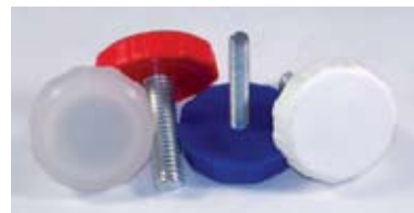
Many colors available as custom option.